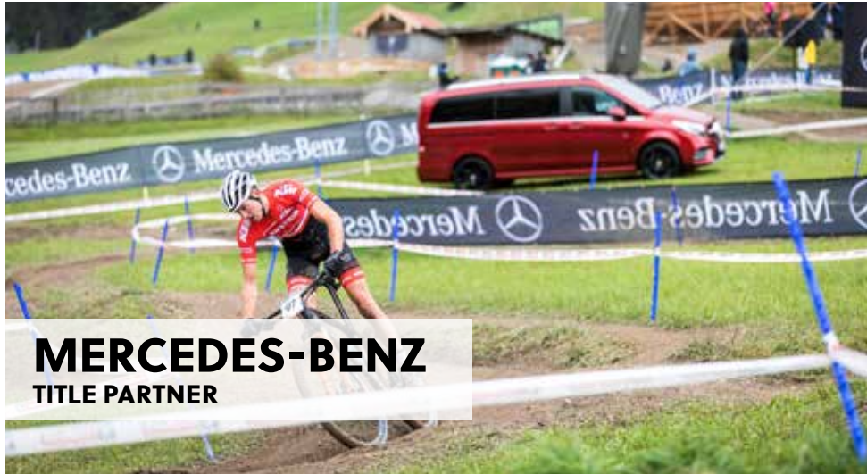
MERCEDES-BENZ TITLE PARTNER

Since 2018, Mercedes-Benz has been partnering with the Mercedes-Benz UCI Mountain Bike World Cup and the UCI Mountain Bike World Championships.