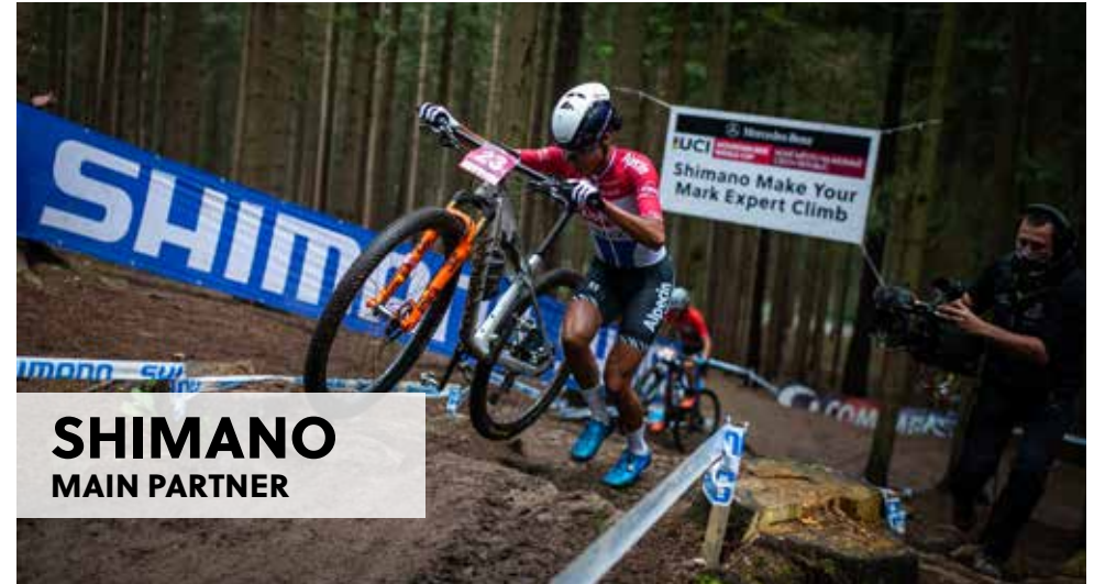
SHIMANO MAIN PARTNER

Shimano has been in partnership with the UCI since 1999 and is committed to helping teams and athletes with technical support at the UCI road, track, mountain bike, mountain bike marathon, cyclo-cross and paracycling World Championships, at the UCI Cyclo-cross World Cup and at the Olympic Games. With 100 years' experience in creating internationally renowned bicycle components, Shimano is proud to have developed products that continue to take countless athletes to victory and provide the means for limitless global bicycle journeys.