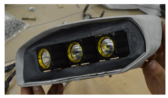
Assembling and testing customized 3D printed Ford Fiesta ST headlights.