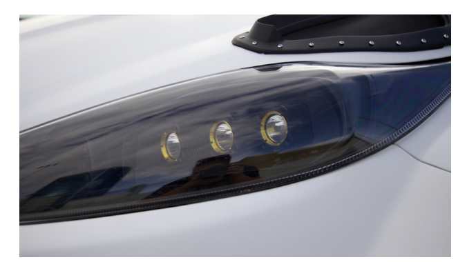
With 3D printing, Tucci can make many more custom parts per project than is possible using traditional model making methods.