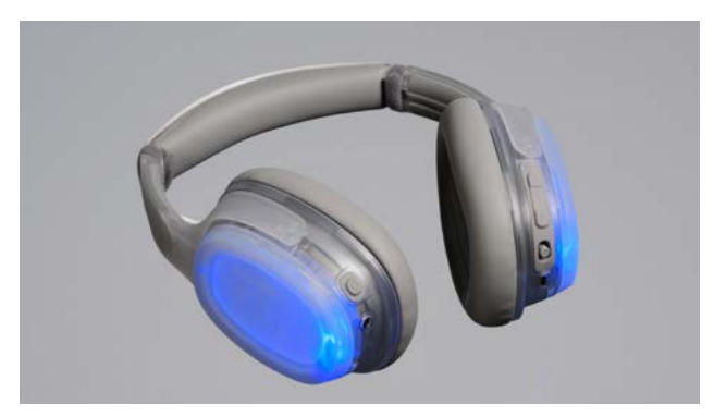
With in-house 3D printing on Ultimaker, BOSEbuild not only cut down on costs but also time, which gave them greater flexibility to iterate product and part designs.