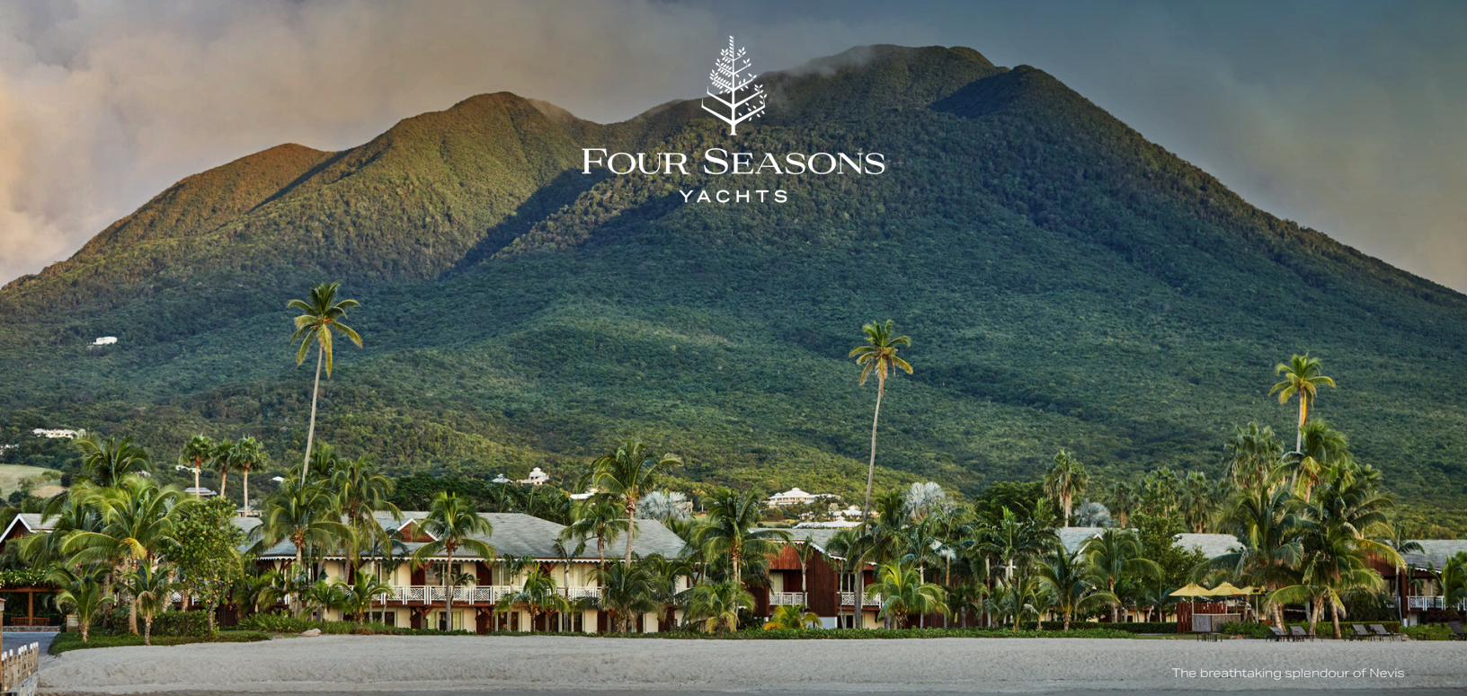
The breathtaking splendour of Nevis