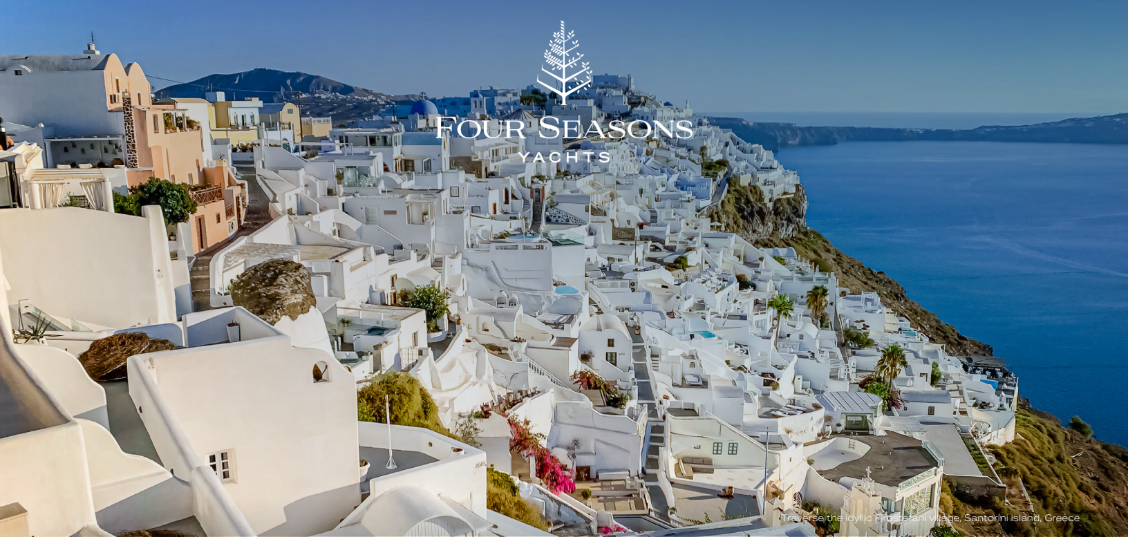
Traverse the idyllic Cycladic village, Santorini island, Greece