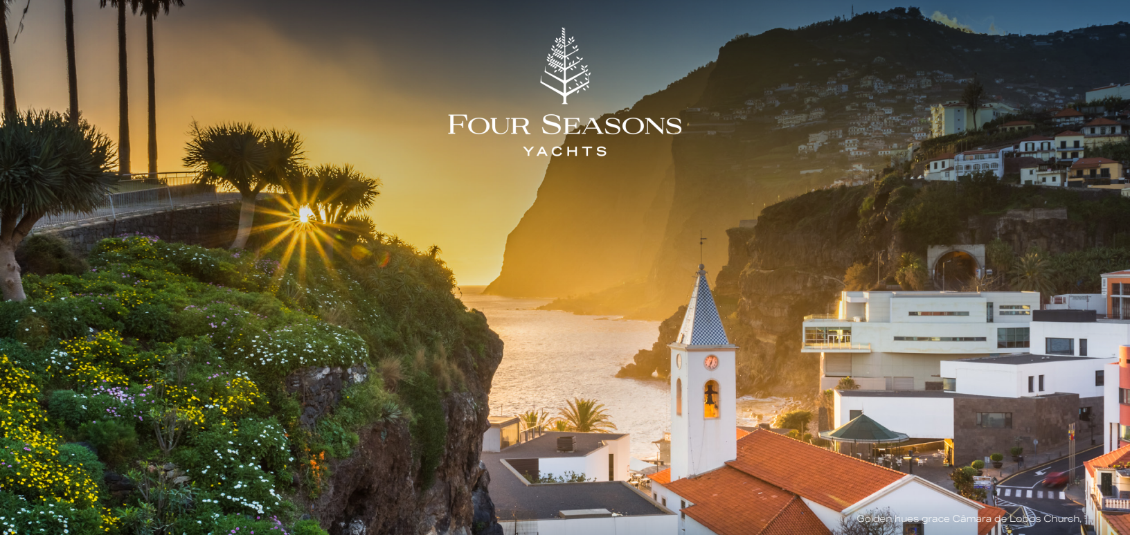
Golden hues grace Câmara de Lobos Church.