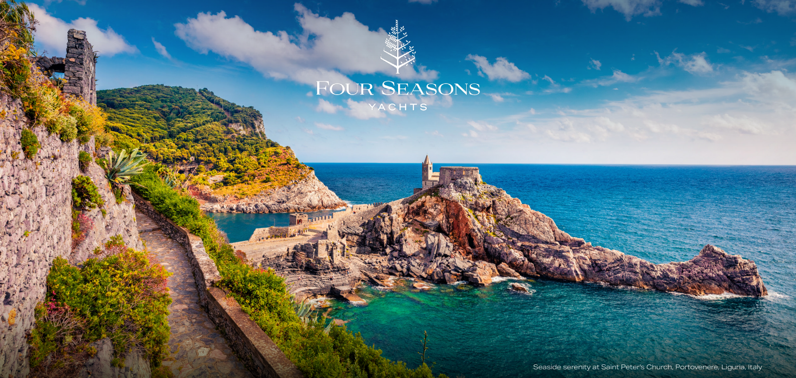
Seaside serenity at Saint Peter's Church, Portovenere, Liguria, Italy