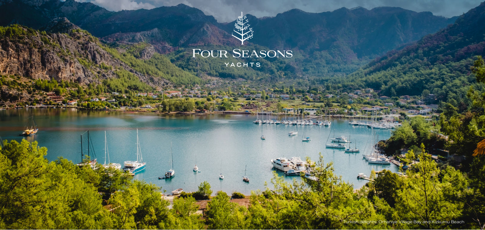
Turkish delights: Orhaniye Village Bay and Kizkumu Beach