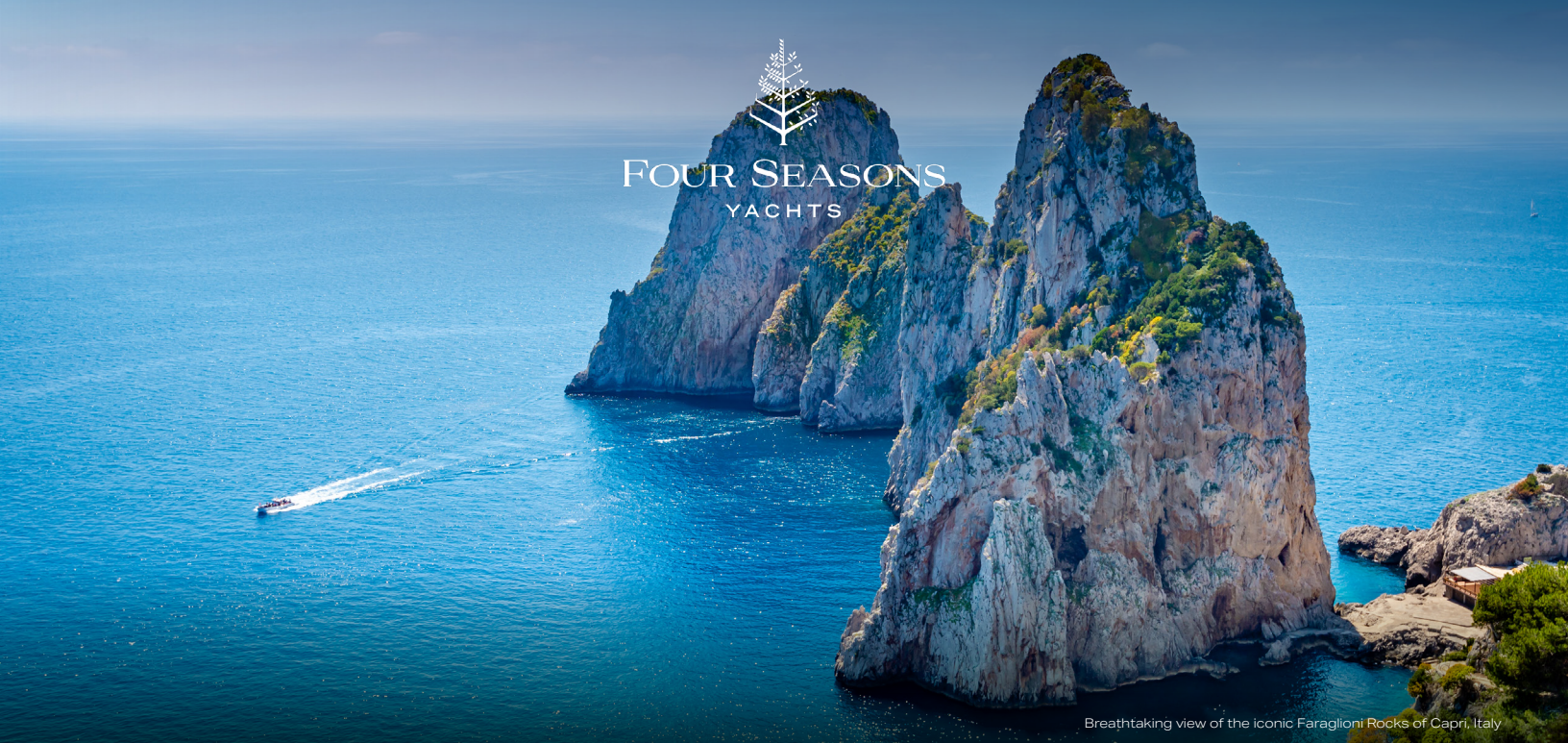
Breathtaking view of the iconic Faraglioni Rocks of Capri, Italy