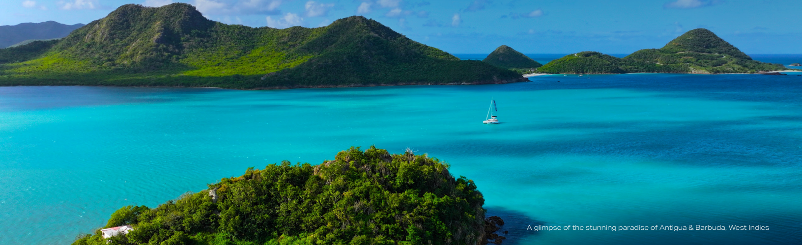
A glimpse of the stunning paradise of Antigua & Barbuda, West Indies