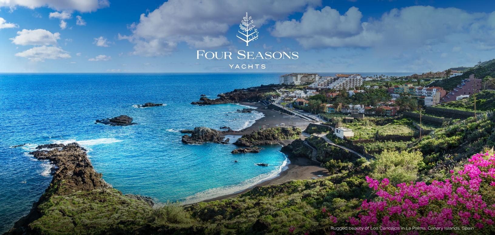
Rugged beauty of Los Cancajos in La Palma, Canary Islands, Spain