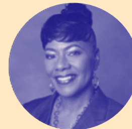
Dr. Bernice A. King