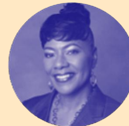
Dr. Bernice A. King