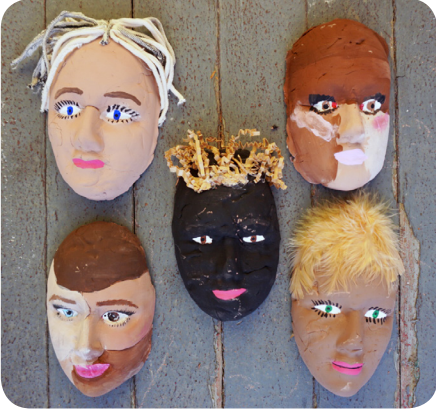
Team Portraits of OMS ( Ozark Middle School ) made these fun, mannequin-like ceramic self-portraits.