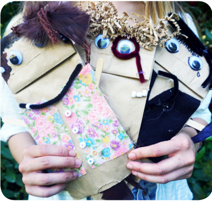
Several students from Missouri sent in these cool and crafty paper bag people portraits—complete with googly eyes!