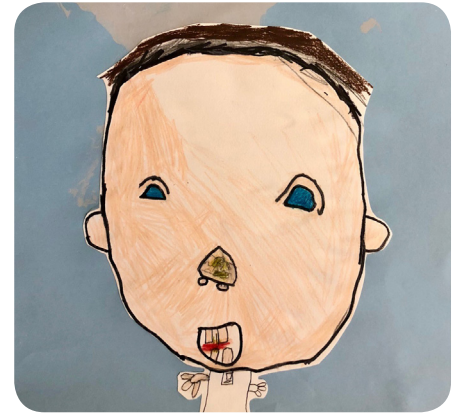
Mrs. J's 1st Grade Art Class shared these super cute and beautiful mixed media portraits, collaging drawings over their paintings.