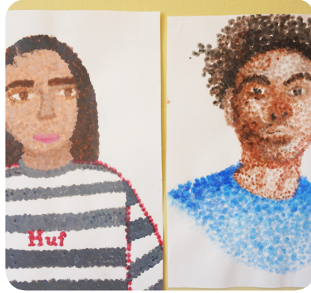
North Mecklenburg High School students submitted dot portraits inspired by pointillism!