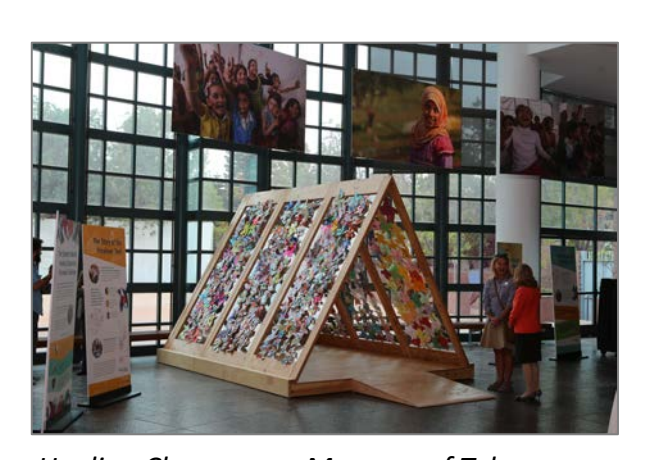
Healing Classrooms, Museum of Tolerance Pinwheels for Syrian refugee children – Montlake Elementary