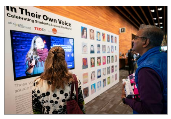
Facing Difference, TED 2018 Self-portraits for youth peace building — TEDEd