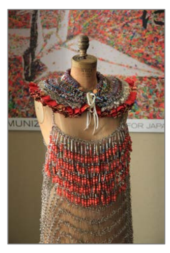
Clean Water for Tanzania Bead gown and collar – Anita Quansah