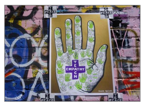
Youth Uplift, Los Angeles Benefit poster and youth event – Teachr