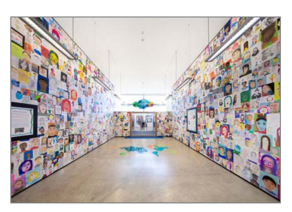
Facing Difference, Figge Art Museum Self-portraits for youth peace building – Creative Arts Academy