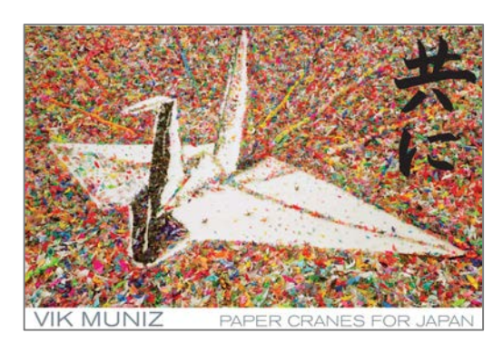
Cranes for Japan — 2011 tsunami Benefit poster — Vik Muniz