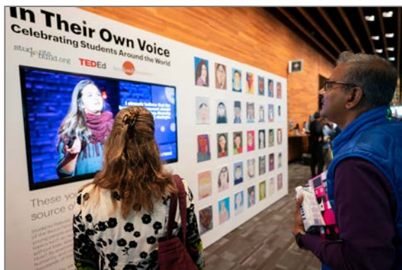
Facing Difference, TED 2018 Self-portraits for youth peace building – TEDEd