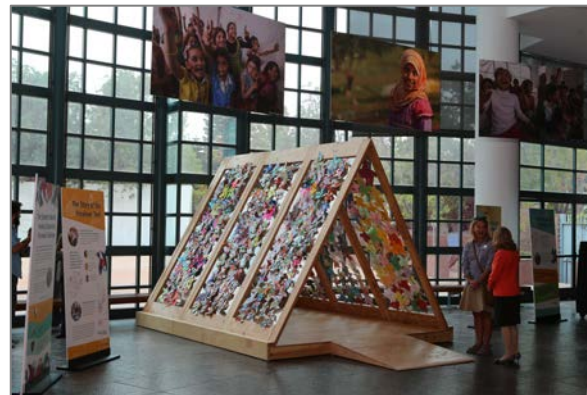
Healing Classrooms, Museum of Tolerance Pinwheels for Syrian refugee children – Montlake Elementary