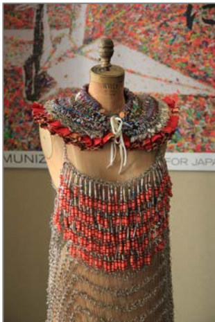
Clean Water for Tanzania Bead gown and collar – Anita Quansah