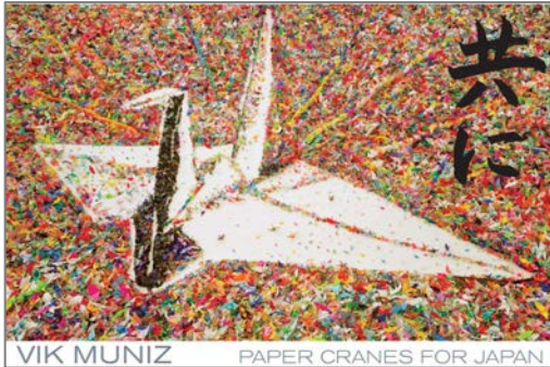
Cranes for Japan – 2011 tsunami Benefit poster – Vik Muniz