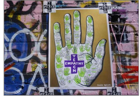
Youth Uplift, Los Angeles Benefit poster and youth event – Teachr