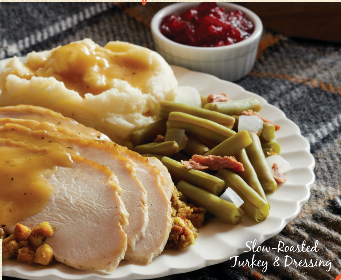
Slow-Roasted Turkey & Dressing