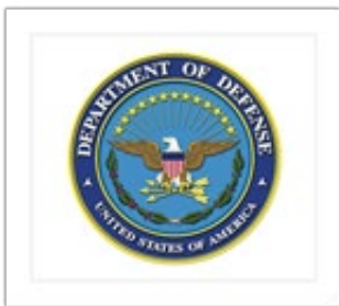
United States Department of Defense (DoD)