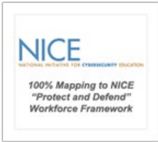
The National Initiative for Cybersecurity Education (NICE)