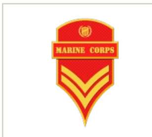
United States Marine Corps