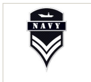
United States Navy