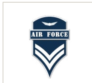
United States Air Force

“ The program trained me to look at every security incident from a different perspective – not as a technical professional but someone who belongs to the managerial level.