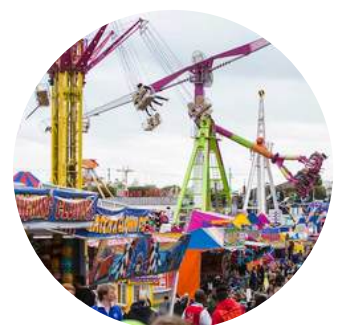
Perth Royal Show

A month-long festival celebrating wildflowers and native plants, featuring garden displays, guided walks, and family activities.