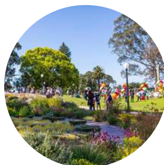
Kings Park Festival

Celebrates Western Australia's culture and heritage with free events, live music, and activities.