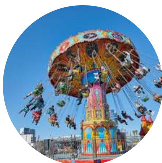
WA Day Festival

An outdoor sculpture exhibition along Cottesloe Beach, showcasing local and international artists.