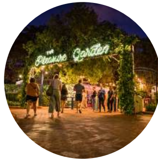
Fringe World Festival

A major cultural event featuring international and local arts, including theatre, music, dance, and visual arts.