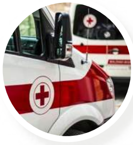
Emergency ambulance services