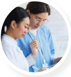
GP/Doctor or Specialist visits (e.g X-rays and blood tests)