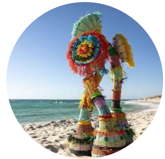
Sculpture By The Sea

A large open-access arts festival with comedy, cabaret, theatre, and street performances.