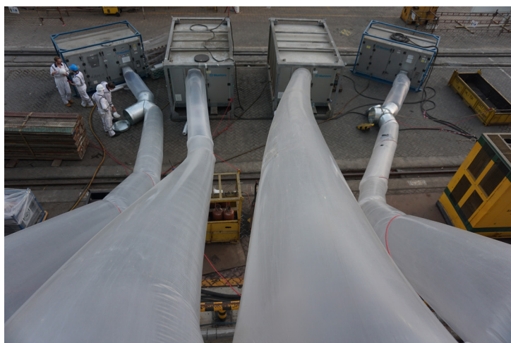
Figure 2. The four dehumidifiers used in the trial.

This multi-disciplinary approach to planning, project management, data assessment and reporting ensured the trial outcomes were valid and could reliably inform industry practice and the development of a model to predict the effect of dehumidification in mitigating the risks of heat stress in sheep being transported by sea.