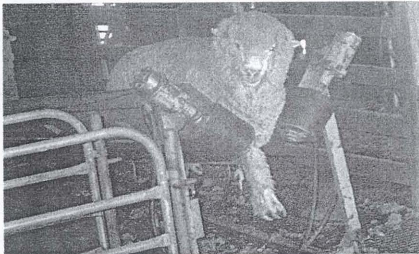
Figure 2. Sheep Leaving a 'VE' Conveyor, one at a time.