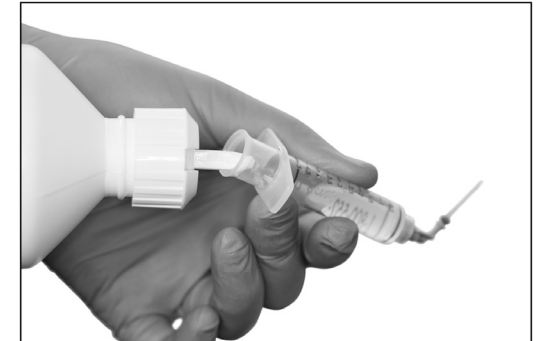
Fig. 2: A 16oz. bottle has plunger removed of the 5ml or 1.2ml (as shown) syringe. Backfill the syringe with irrigant from the bottle. Reinsert plunger and remove the entrapped air.