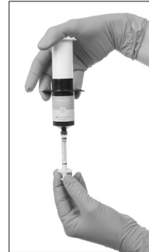
Fig. 1: A 5ml or a 1.2ml (as shown) unit dose syringe is twisted firmly onto the IndiSpense syringe. While supporting plunger of unit dose syringe with the nondominant hand, depress plunger of the IndiSpense and fill unit dose syringe to desired level.