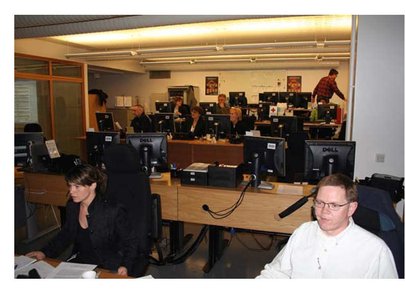
From the November exercise on responses to an influenza pandemic.

Communicable disease responses in Iceland were tested in conjunction with the European exercise. The exercise took place in the Joint Rescue Coordination Centre in Reykjavik under the command of the Chief Epidemiologist for Iceland and the Civil Protection Department of the National Commissioner of the Icelandic Police, in accordance with government resolutions on responses to this kind of emergency. Participants in the exercise included representatives from the Directorate of Health, the Icelandic Coast Guard, the