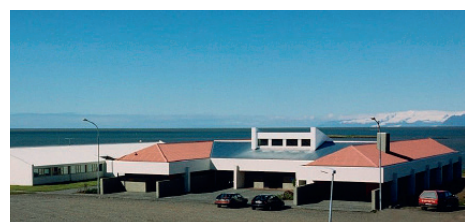
The Health Institution of South Iceland – Höfn in Hornafjörður