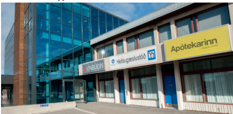
The Health Institution of South Iceland – Hella