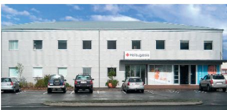
The Health Institution of South Iceland – Hveragerði