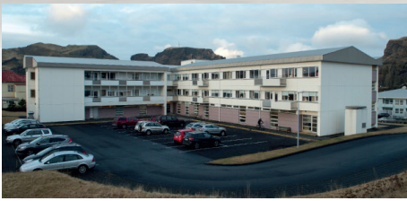
The Health Institution of South Iceland – Vestmannaeyjar