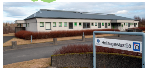
The Health Institution of South Iceland - Laugarás