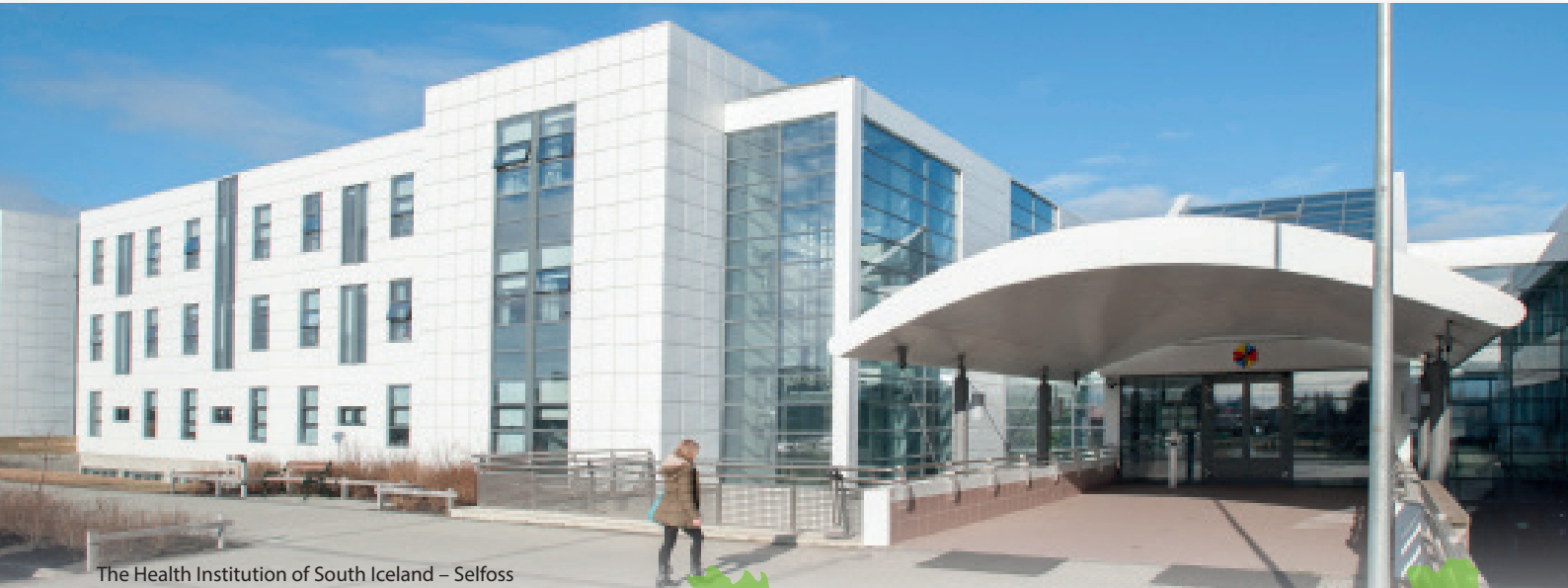
The Health Institution of South Iceland – Selfoss