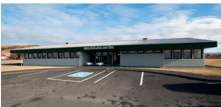
The Health Institution of South Iceland – Hvalsvöllur