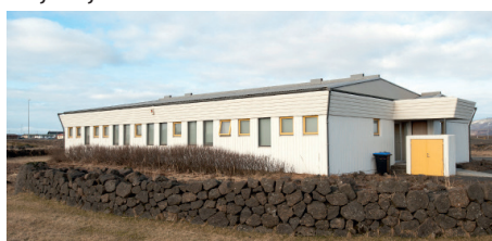
The Health Institution of South Iceland – Þorlákshöfn