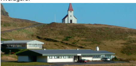
The Health Institution of South Iceland – Vík in Mýrdalur