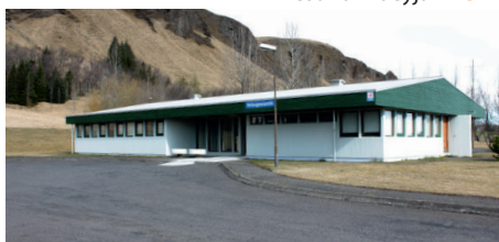
The Health Institution of South Iceland – Kirkjubæjarklaustur