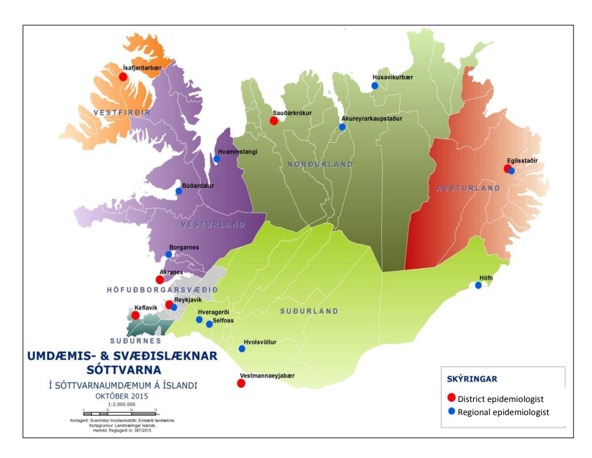
Figure 2. The epidemiological districts of Iceland and headquarters of District Epidemiologists