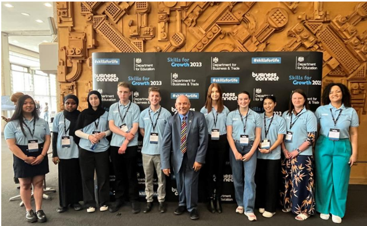
Ambassadors joined the Minister for Skills, Apprenticeships and Further Education Robert Halfon at an event in London.

The network grows and becomes more inclusive and diverse. This paves the way for future apprentices by creating more opportunities for individuals to thrive.