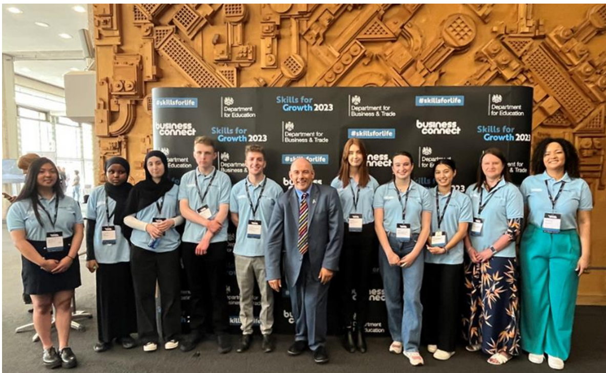
Ambassadors joined the Minister for Skills, Apprenticeships and Further Education Robert Halfon at an event in London.

The network grows and becomes more inclusive and diverse. This paves the way for future apprentices by creating more opportunities for individuals to thrive.