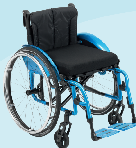
Avantgarde DV shown

The Avantgarde DV impresses with its light weight, but this doesn't mean it's lost any of its proven advantages. Users like the new DV's height-adjustable armrest, but also the option of driving up close to objects such as furniture, the barbeque or bath. The leg supports can be folded in for this purpose. It is also suitable for stroke patients when the leg supports are removed, which is done with a new type of lever.