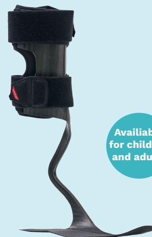
WalkOn Reaction shown