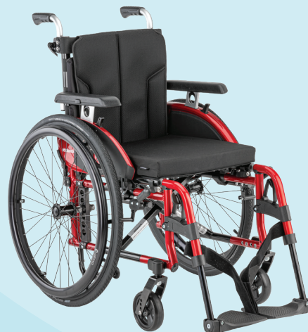
Motus CV shown

The Motus family consists of four variations, the Motus CV a folding wheelchair with swing-away detachable leg supports, Motus CS folding wheelchair with fixed front frame and an active design, Motus Hemi has a low seat height for foot propelling abilities also has a one arm drive option if required and Motus XXL has a seat width up to 55.5cm.