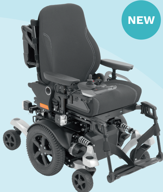
Mid-wheel Drive Shown