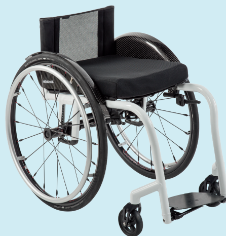
Zenit CLT shown

Zenit R and Zenit R CLT wheelchair for active use stands out for its low weight and a rigid axle. All energy is transformed directly into motion, tremendously improving the quality of the driving characteristics. Numerous adjustment options also permit optimal adaptation for even greater comfort and make the Zenit R and Zenit CLT R an uncompromising wheelchair for active users.