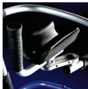
Grip bar with forearm supports and vertical hand grips