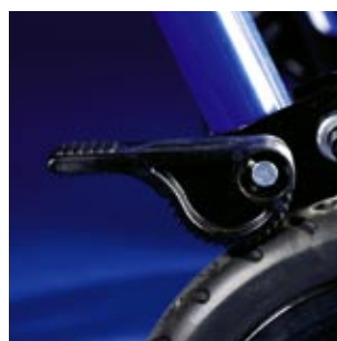
Reverse-roll lock at the rear wheels (can be activated and deactivated)