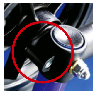
Friction brake at the rear wheels