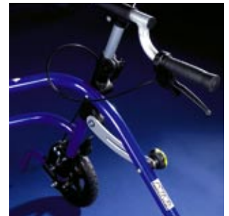
Driving brake and wheel lock