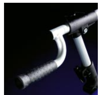
Grip bar with universal grips for grip width reduction