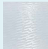
Textured inner surface for reliable hold.