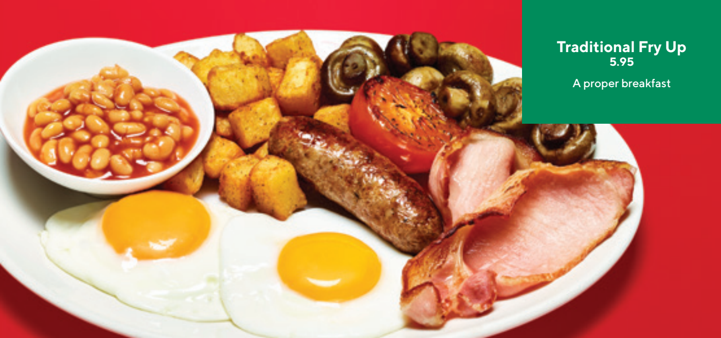
Traditional Fry Up 5.95 A proper breakfast