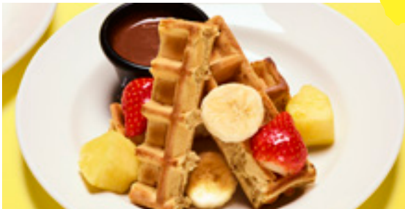
Mini Waffle Dippers Chopped waffle, chocolate dip and fruit

Choose from: Banana, Strawberry & Chocolate | Bacon & Maple Syrup