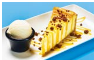
Vanilla with Salted Caramel Sauce

Gluten free Food & Drink options available