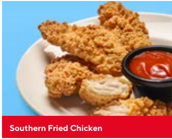
Southern Fried Chicken