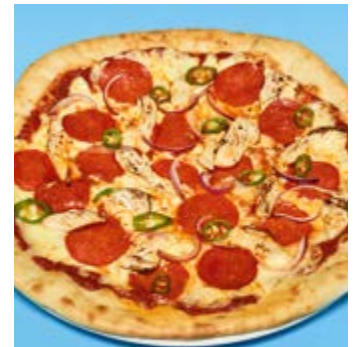
Spicy Chicken Americano