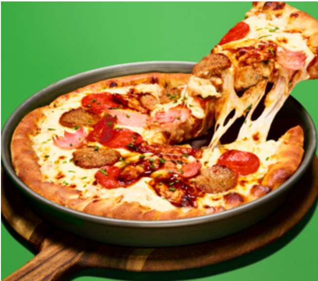
The American Deep-Pan Deluxe 13.69 A 10" deep-pan pizza with pepperoni, ham, pork & beef meatballs, chicken and mozzarella on a BBQ sauce base