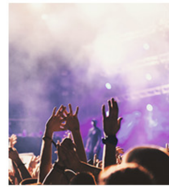
Artists, Athletes & Entertainers