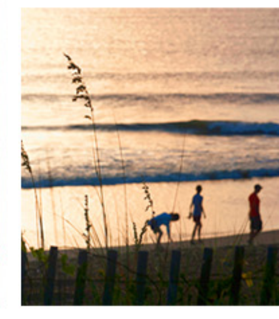
High-Net Worth Individuals & Families