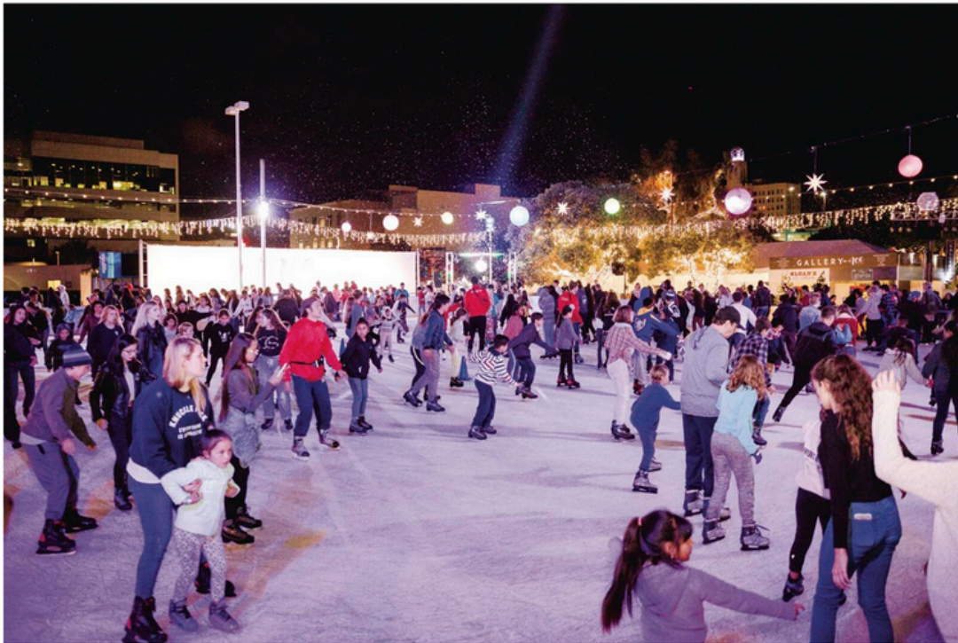
Ice at Santa Monica is a popular wintertime destination.