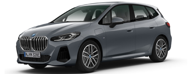
225e xDRIVE M SPORT PLUG-IN HYBRID