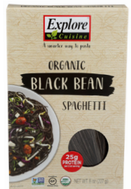
Explore Cuisine Organic Legume Pasta (selected varieties)