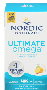
Nordic Naturals Ultimate Omega