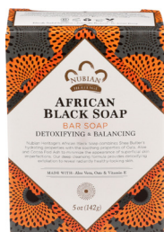
Nubian Heritage African Black Bar Soap