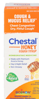
Boiron Chestal Honey