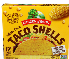
Garden of Eatin' Taco Shells