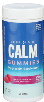
Natural Vitality Calm Gummies