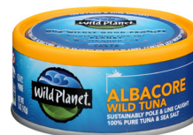
Wild Planet Wild Albacore Tuna