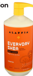
Alaffia EveryDay Shea Body Lotion