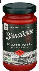
Bionaturae Organic Tomato Paste