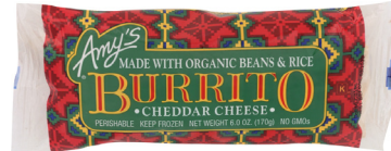
Amy's Burrito (selected varieties)