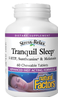
Natural Factors Stress Relax® Tranquil Sleep Chewable