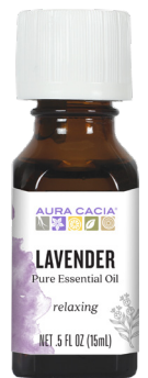
Aura Cacia Lavender Essential Oil