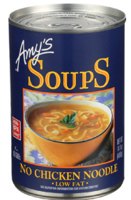
Amy's Soup (selected varieties)