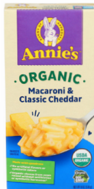
Annie's Organic Mac & Cheese