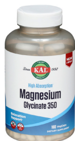
KAL Magnesium Glycinate 350