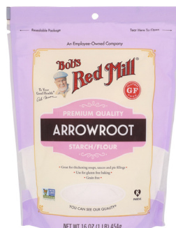
Bob's Red Mill Arrowroot Starch