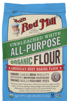
Bob's Red Mill Organic Flour (selected varieties)