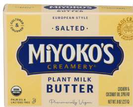
Miyoko's Organic Cultured Vegan Butter