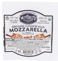
Miyoko's Organic Vegan Mozzarella

Built on the foundation of craft and compassion, Miyoko's Creamery is the natural, compassionate evolution of dairy—using time-honored techniques and the finest ingredients to make our award-winning, phenomenally vegan, plant milk butter and cheese.