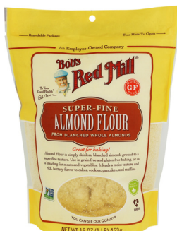
Bob's Red Mill Almond Flour