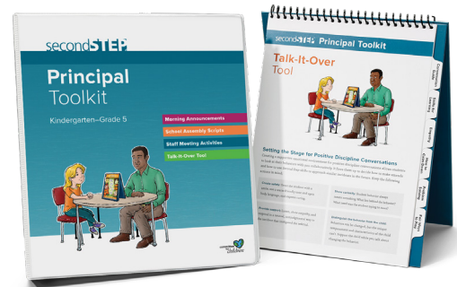
Second Step Principal Toolkit

Tools include scripted meeting agendas to introduce all staff to Second Step SEL; ready-to-use morning announcements, school assembly scripts, and communications to staff; and an office referral conversation guide to engage students in planning how to use Second Step skills to change behavior. The toolkit supports skill reinforcement in and out of the classroom, encourages positive behavior with a common schoolwide language, and strengthens efforts to create a safe, supportive environment for learning.