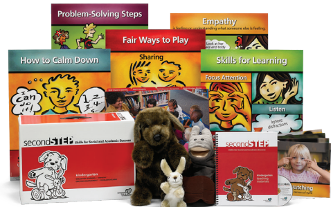
Kindergarten–Grade 5 Second Step SEL

Evidence-based Second Step SEL helps make it easy for teachers to integrate social-emotional learning into their classrooms, which decreases problem behaviors and increases whole-school success by promoting self-regulation, safety, and support. It aligns with many other school initiatives and standards, including Positive Behavior Interventions and Supports (PBIS), Response to Intervention (RTI), the American School Counselor Association (ASCA) Mindsets and Behaviors, academic standards, Restorative Practices, and trauma-informed practices.