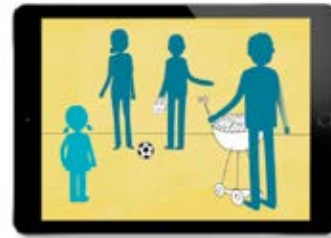
Family Video: Sexual Abuse Should Not Happen to Our Children

The Child Protection Unit also includes materials to support school leaders and staff in engaging and educating families. Some materials relate directly to the student lessons, and an online series of short, compelling media pieces teaches caregivers about child sexual abuse. The videos aim to reduce their anxiety about discussing this subject with their children and give them realistic recommendations for conversations with kids. The media pieces are supplemented with online content explaining how parents can reinforce safety skills, recognize maltreatment, and report abuse.