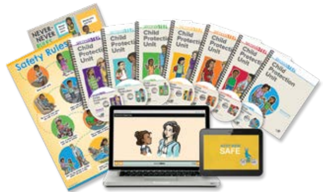
Child Protection Unit for Early Learning–Grade 5

The Child Protection Unit lays the groundwork to meet the needs of children who have experienced or are at risk for experiencing maltreatment in an educational setting. Implementation of this unit can help schools strengthen the layers of protection, safety, and support for all students.