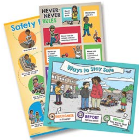
Grades EL-5 Lesson Posters