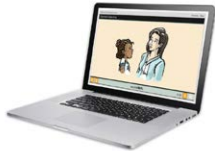
Online Staff Training Module 2: Recognizing, Responding to, and Reporting Abuse