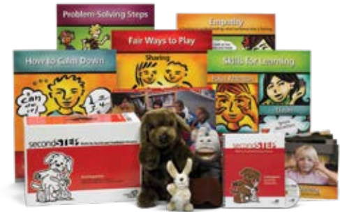
Kindergarten–Grade 5 Second Step SEL

Evidence-based Second Step SEL helps make it easy for teachers to integrate social-emotional learning into their classrooms, which decreases problem behaviors and increases whole-school success by promoting self-regulation, safety, and support. It aligns with many other school initiatives and standards, including Positive Behavior Interventions and Supports (PBIS), Response to Intervention (RTI), the American School Counselor Association (ASCA) Mindsets and Behaviors, academic standards, Restorative Practices, and trauma-informed practices.