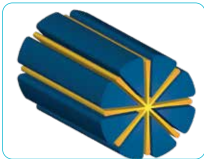
16 Split Microfiber