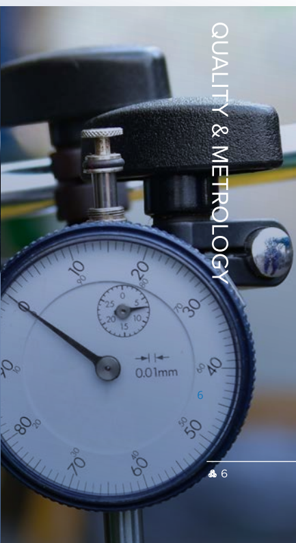
QUALITY & METROLOGY