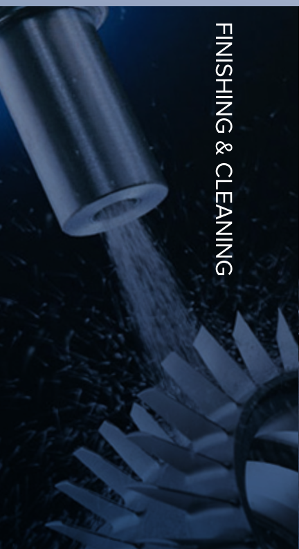
FINISHING & CLEANING