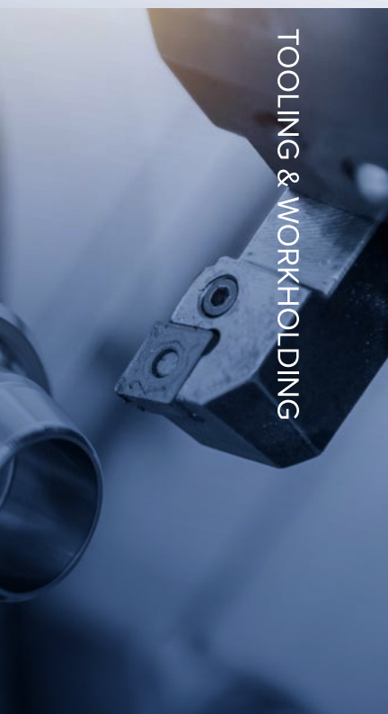
TOOLING & WORKHOLDING