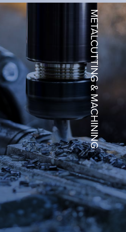
METALCUTTING & MACHINING