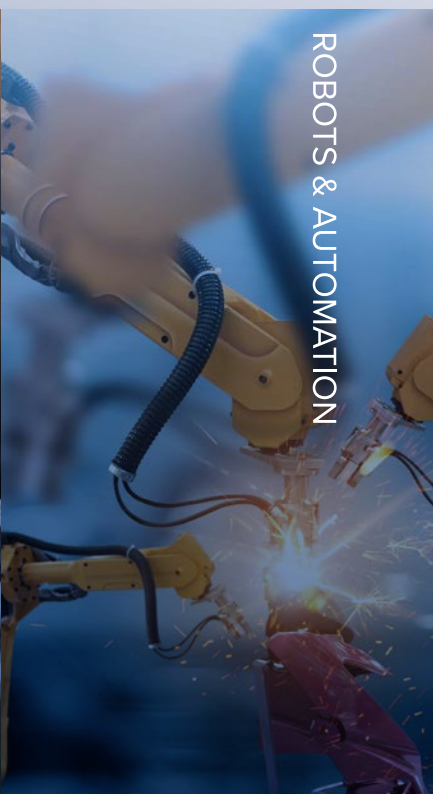
ROBOTS & AUTOMATION