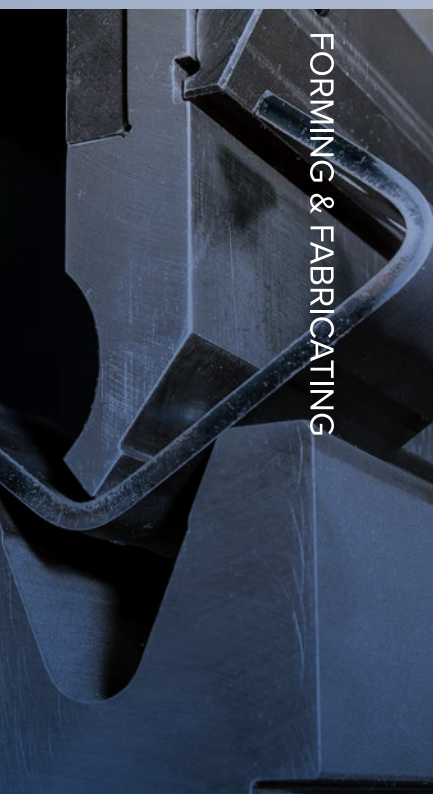
FORMING & FABRICATING