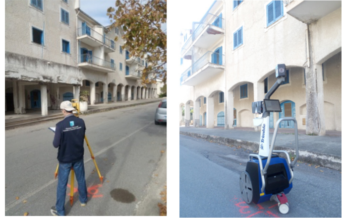
Left: Support point measurement stage. Right: TIMMS in the ground control point measurement stage.

The final step before producing a 3D model was measuring the vertical distances between the outermost extents of the floors, again performed in Trimble RealWorks. This information was required to correctly define the irregularities between the individual floors in ArchiCAD.