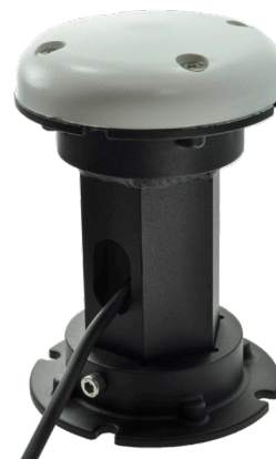
Antenna shown with optional bracket. Bracket allows for mounting on single center 5/8 bolt or four perimeter bolts.

86362 ..... Trimble AV34 Antenna (White) 86362-10 ..... Trimble AV34 Antenna (Black)