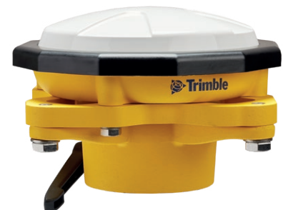
Zephyr 3 with 3" mast mounting PN 125000-10-INT