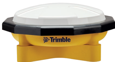
Zephyr 3 with 5/8" mounting PN 125000-30-INT