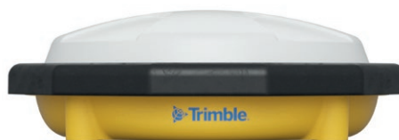
Zephyr 3 without bracket PN 125000-20-INT