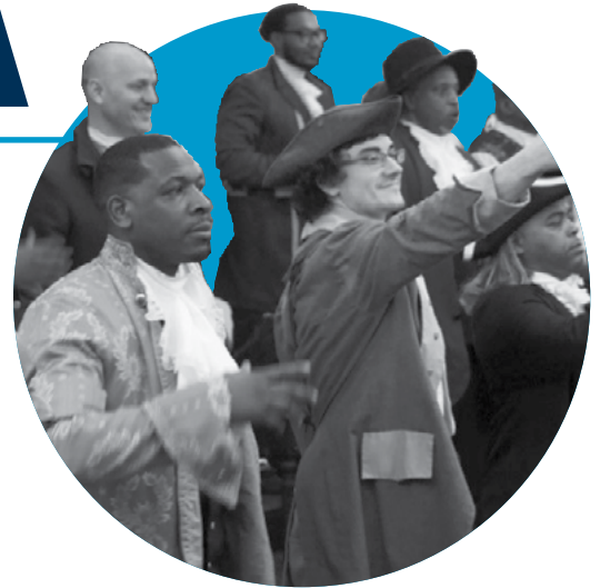
RTA members during the production of 1776 at Sing Sing Correctional Facility

“Where the prison culture preaches every man for himself, RTA stresses that each member is needed for the group to be whole.”