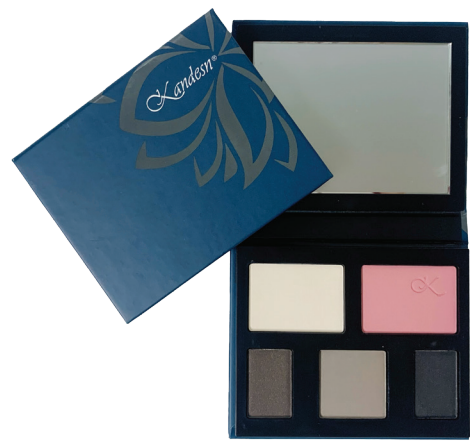
Black Sand Beach (Cool)

A: You can choose based on the palette that best suits your skin undertone. Skin tone is made up of an undertone and a surface colour. An undertone is the colour that lies beneath the skin. It's almost like a shadow below your skin colour. While your skin tone can change, your undertone never does.