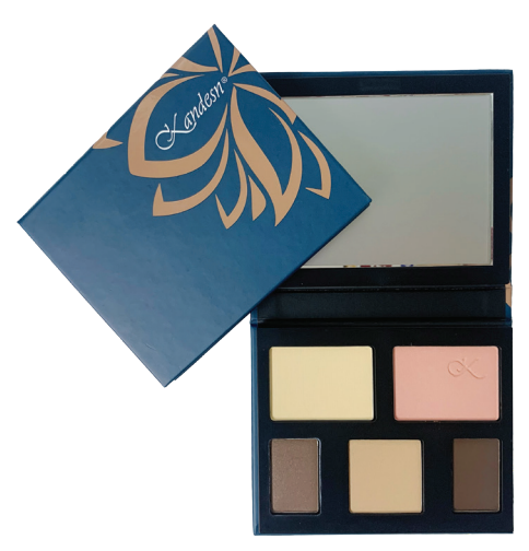
Sunset Rose (warm)

One quick trick is to hold up a blank piece of white paper next to your face and look in the mirror. If your skin looks more on the yellow side, it means you're warmer toned. If your skin looks pink, you are on the cool spectrum. If you have trouble deciding, you may have a neutral skin tone. Lucky you! This means both cool and warm tones are flattering on your skin.