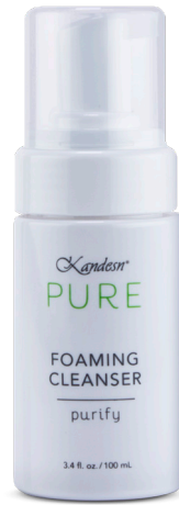
100 mL #01533