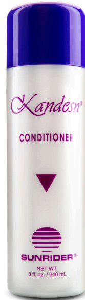
240 mL #34018